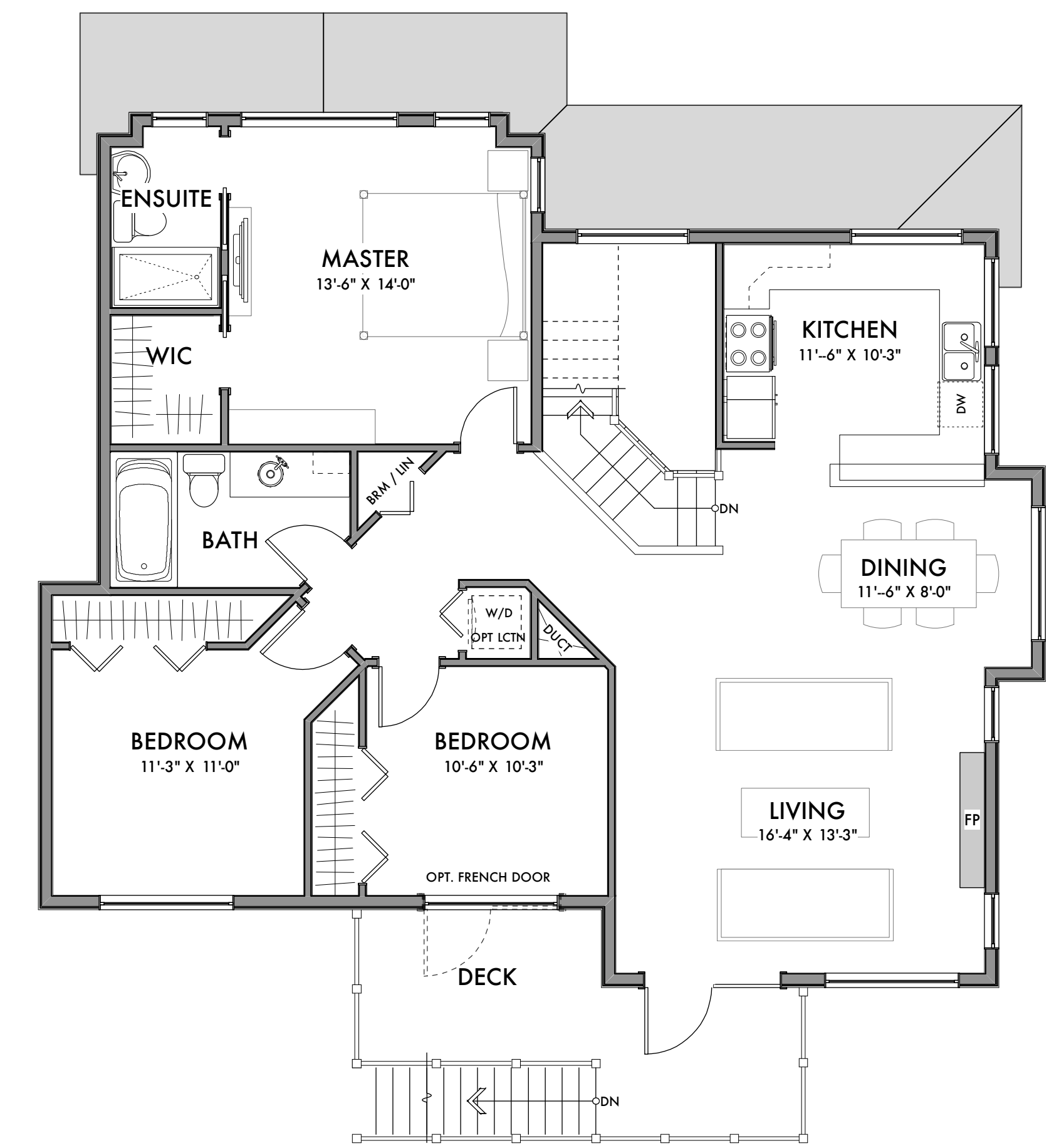
UPPER FLOOR PLAN 3/16"=1'-0"